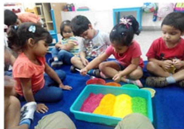
Learning to use a spoon to pour coloured rice carefully into a bowl, without dropping it. It improves their fine motor skills.