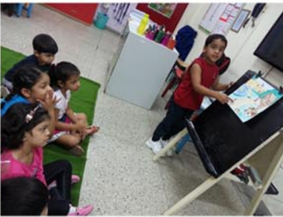
My Beautiful Garden