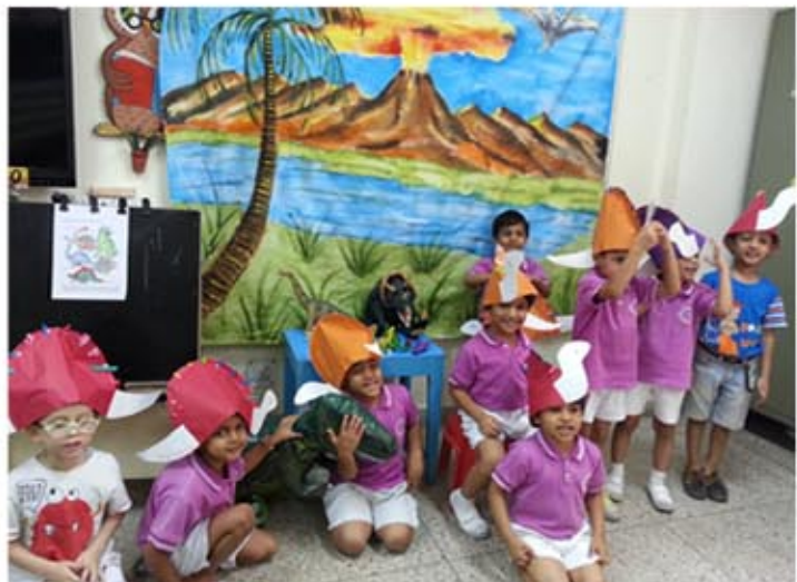
The land of Dinosaurs

The children of Nursery explore different themes which are related to the letters they are learning in class.