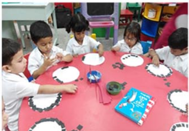
Learning by doing- learning 'c' sound with Dr. Seuss's 'The cat in the hat', while making a cat face