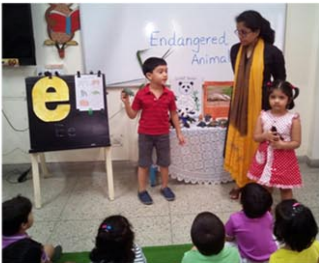
Endangered and Extinct species