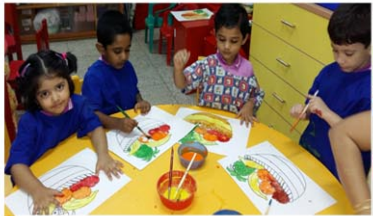
Fruits are healthy food