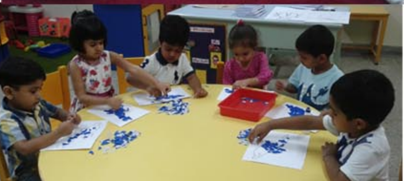
Children made a dolphin using the tearing and pasting method.