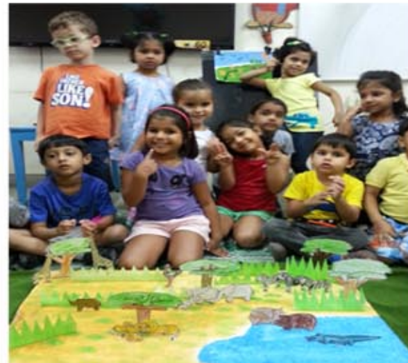
The Grassland animals