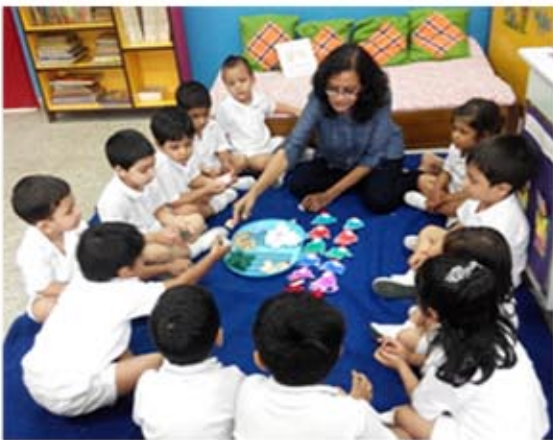
Exploring the tactile sense, by placing various materials on their handprints, to depict surfaces like rough, smooth, soft, hard etc.